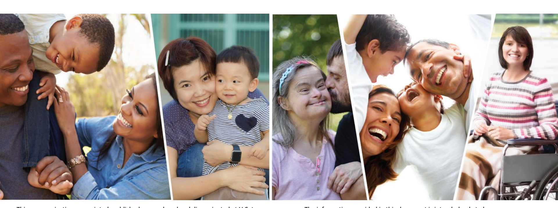
This communication was printed, published, or produced and disseminated at U.S. taxpayer expense. The information provided in this document is intended only to be a general informal summary of technical legal standards. It is not intended to take the place of the statutes, regulations, or formal policy guidance that it is based upon. This document summarizes current policy and operations as of the date it was presented. We encourage readers to refer to the applicable statutes, regulations, and other interpretive materials for complete and current information.