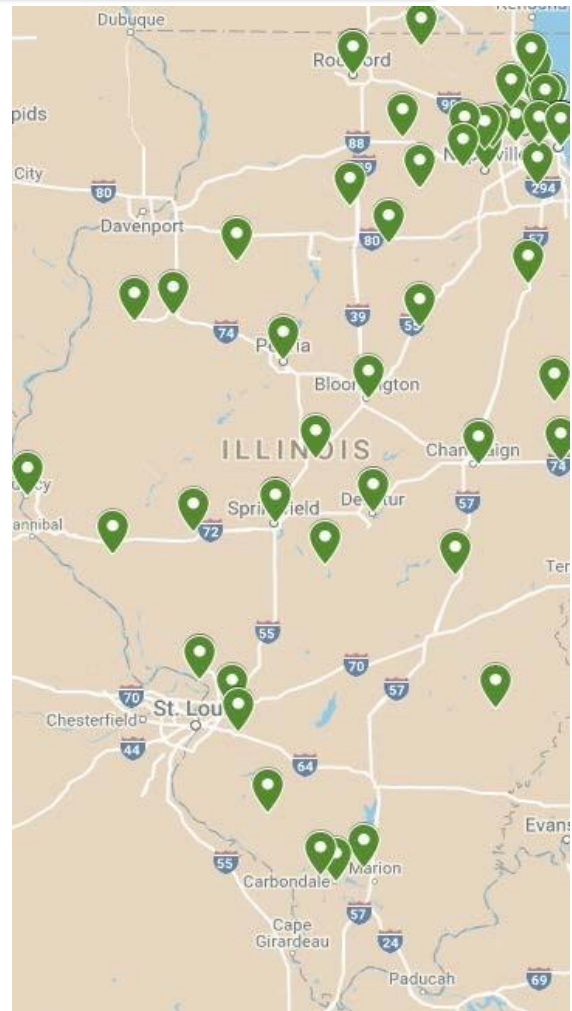
EHR-Integrated PMPNow Connections, May 2018

Initiative 1.2: Give licensed delegates (e.g., registered nurses, physician assistants, certified nurse practitioners) and other non-licensed professionals access to the Illinois Prescription Monitoring Program